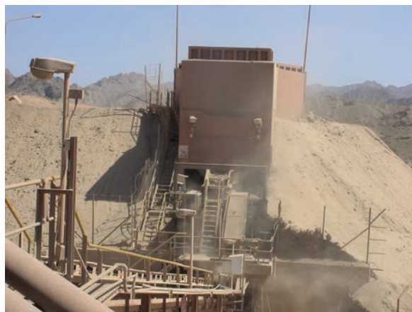
Figure 3. Photograph shows the jaw crusher.

has not been removed in the previous adsorption tanks. The carbon will be eventually removed from the circuit at the first adsorption tank for stripping (i.e., loaded carbon). By the time the slurry reaches the final adsorption tank, most of its gold has been removed by the carbon (i.e., the barren slurry). The barren slurry then passes out the final adsorption tank to the tailings filter needle tank. Slurry from the tailings filter needle tank is pumped into the filter press and is dewatered. The filter cake is dropped from the filter press onto the ground where it is removed by front end loader, loaded onto trucks and dumped into the tails dam. The filtrate gravity flows to the process water tank.